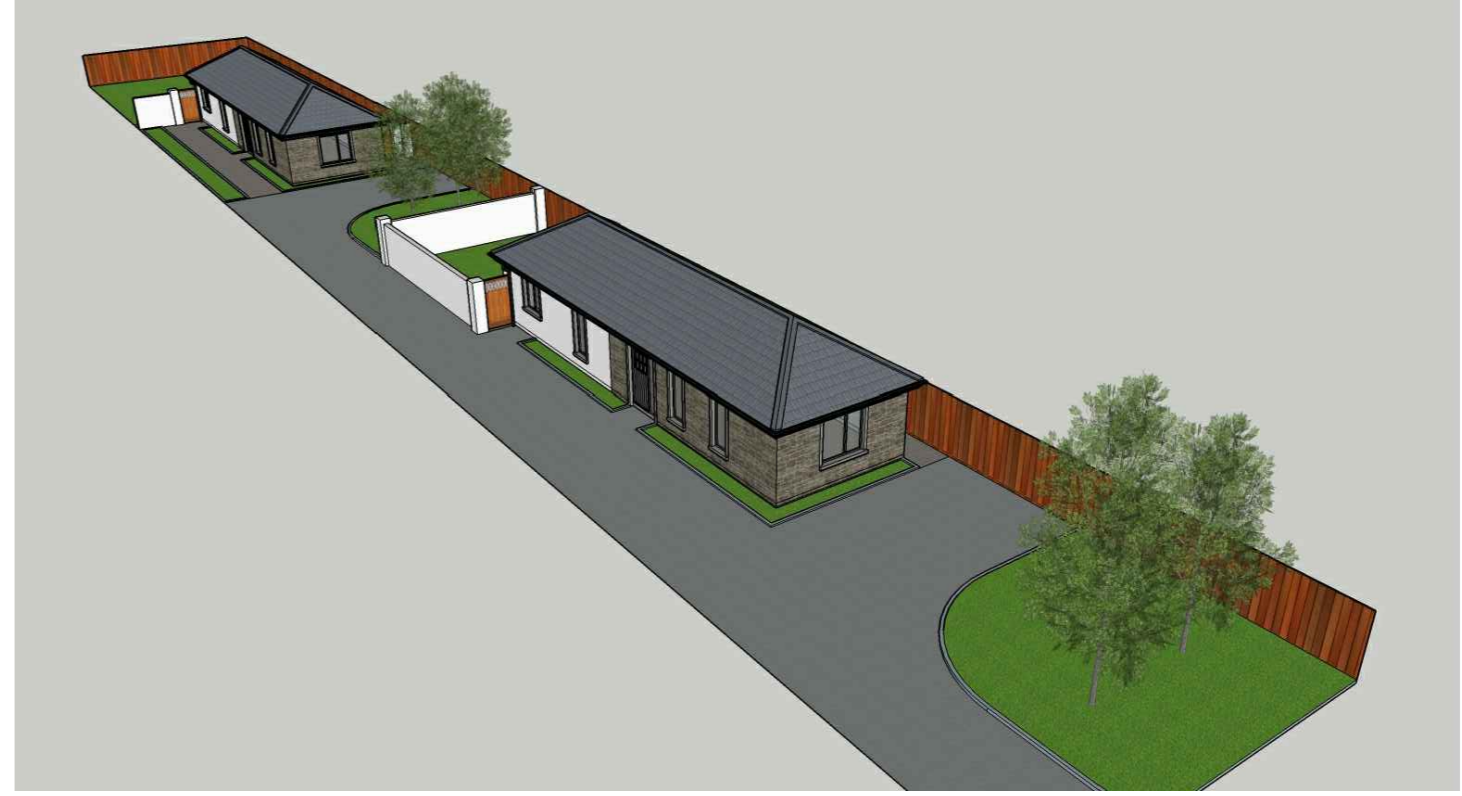
03 3D of Proposed Site